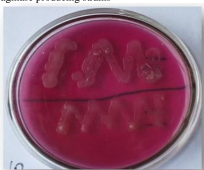
Figure 1 Bacillus sp. Colonies showing pink zone on M-9 media supplemented with 0.09% phenol red.

Strains with pink colour zones around the colonies were considered as positive result for L-asparaginase producing strains